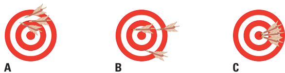
Differentiating between accuracy and precision

Precision describes the exactness and repeatability of a value or set of values. A set of data could be grouped very tightly, demonstrating good precision, but not necessarily be accurate. The darts in illustration (A) missed the bull’s-eye and yet are tightly grouped, demonstrating precision without accuracy.