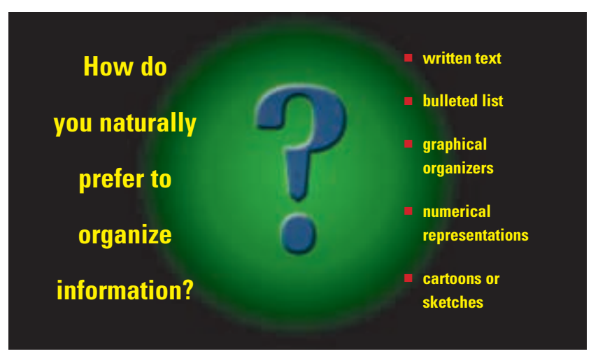
Figure 1.8 Recognizing the modes of organization that you prefer will help you develop your problem-solving strategies.