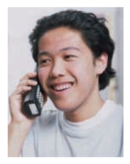
Figure 1.9 Framing a problem and developing solution strategies is applicable to all types of problems.